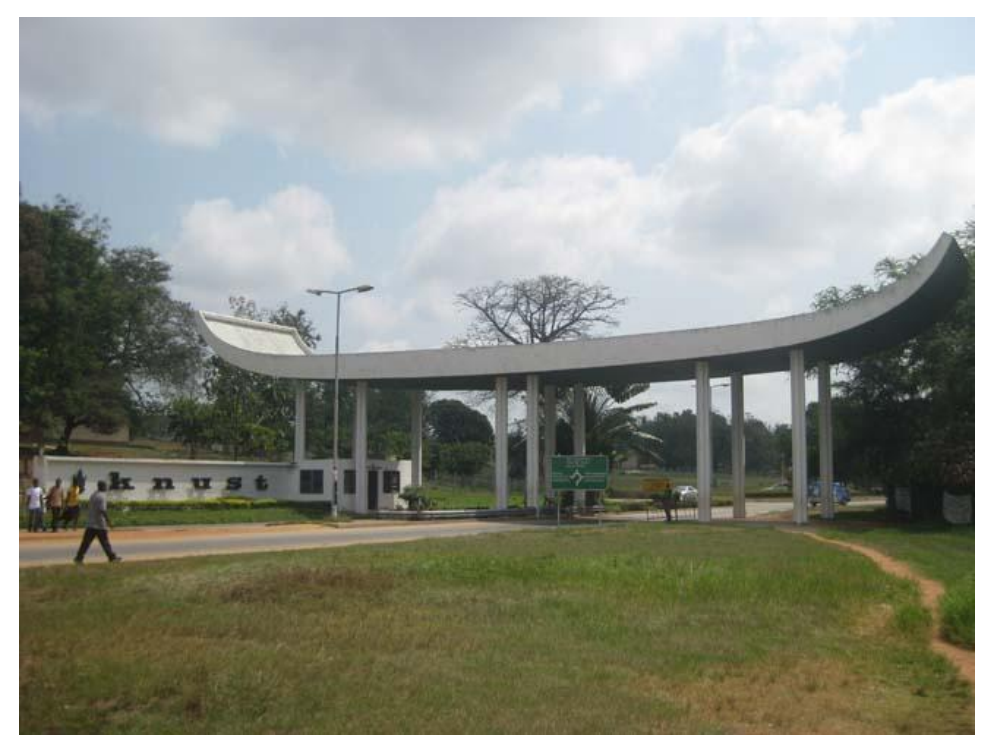
KNUST campus, Kumasi, Ghana