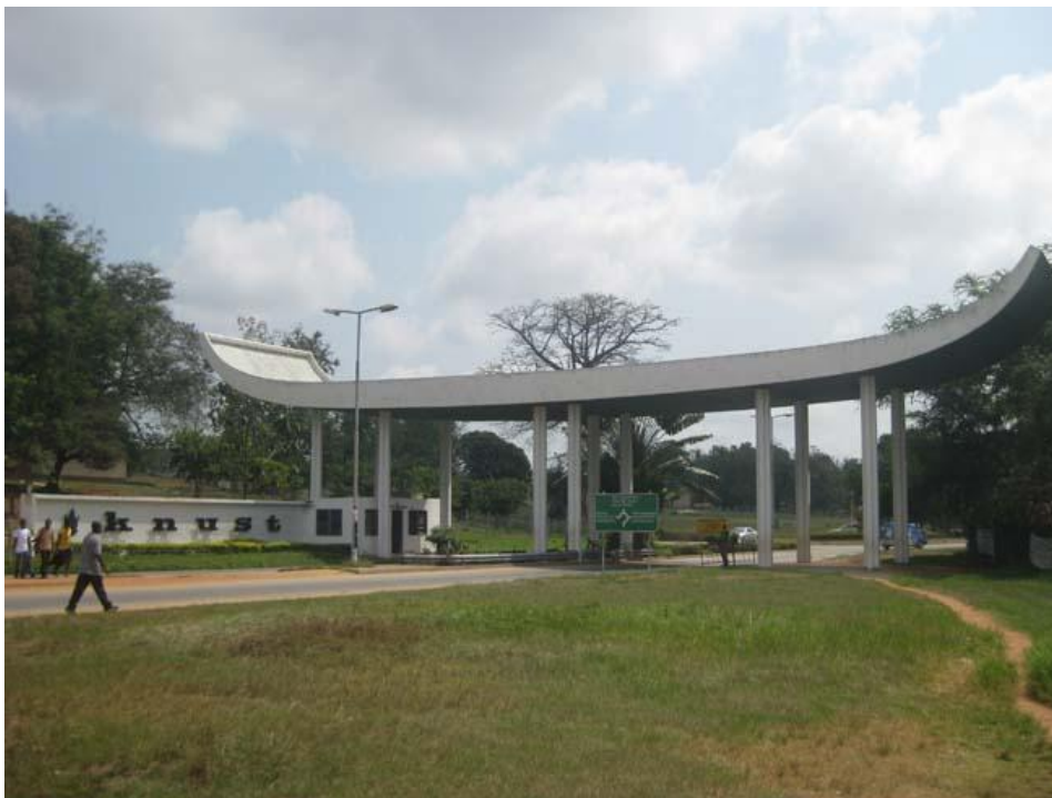
KNUST campus, Kumasi, Ghana