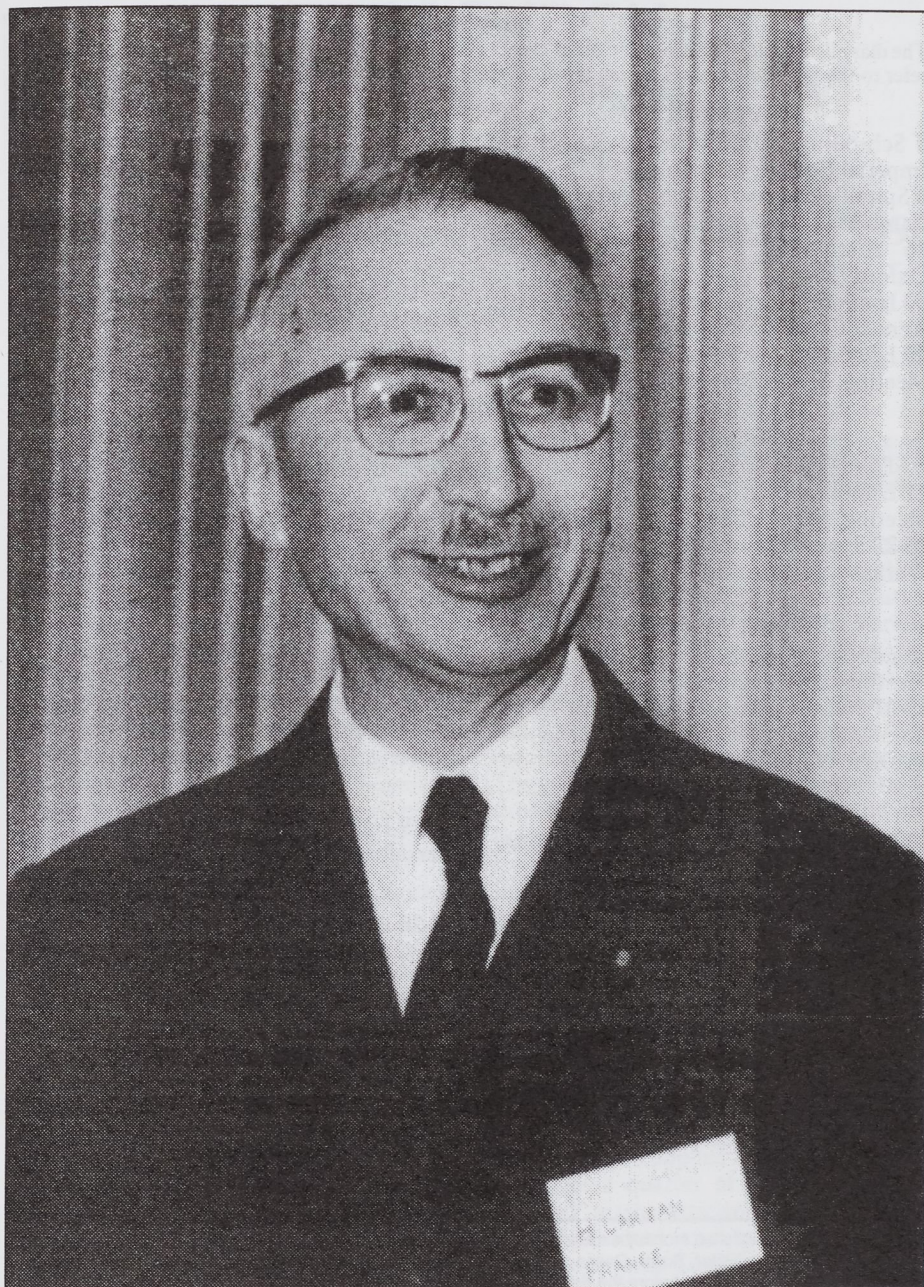
H. CARTAN Honorary Member 1959