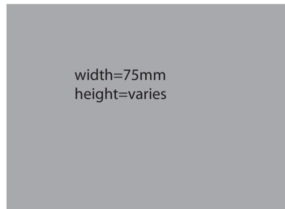
Figure 3. A caption

The author is responsible for obtaining all relevant permissions for image use.