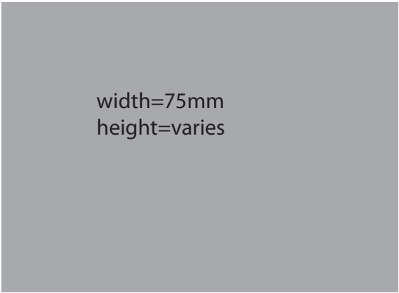
Figure 1. A caption

Writing to strict page limits can be a challenge, but it is an enjoyable challenge!