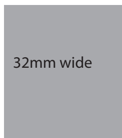
Figure 2. A caption

The use of quality images and figures is strongly encouraged. Images should either be the full width of a column, or have 32mm width.